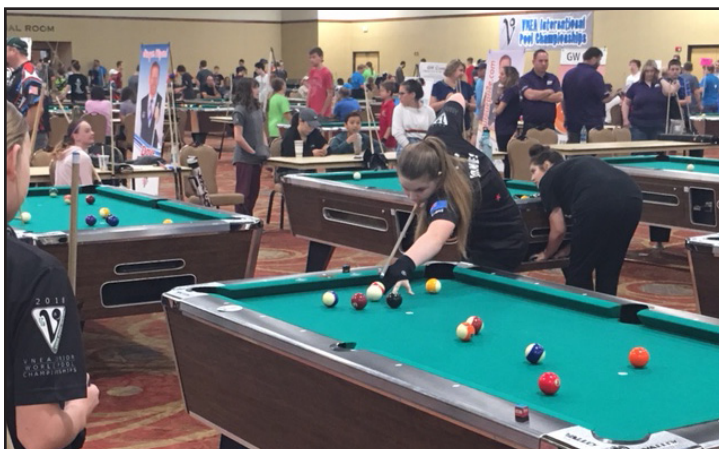
VNEA World Junior Pool Championships