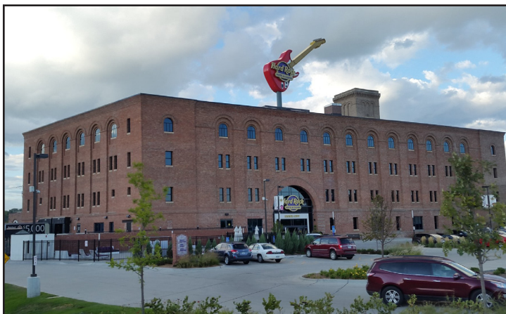
Hard Rock Casino