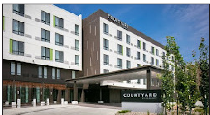
Courtyard by Marriott - Host Hotel

Photo Tour Of This Property: https://tinyurl.com/5eejxz3d