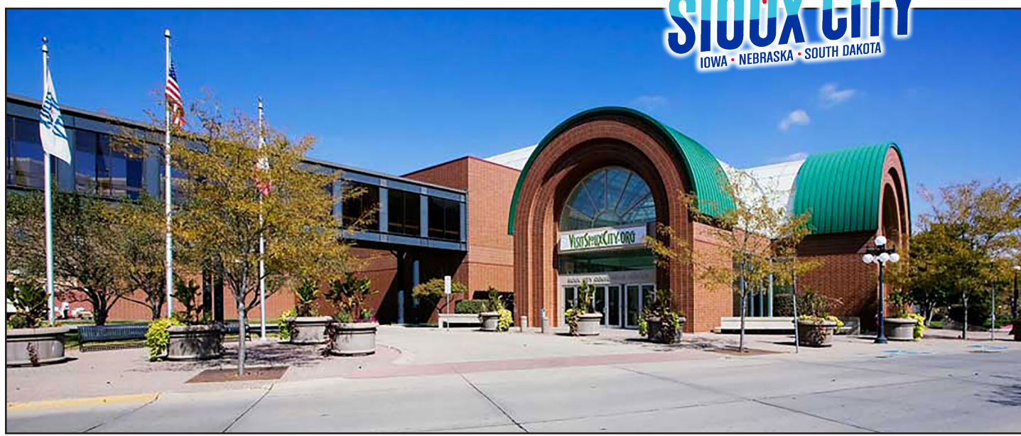
Sioux City Convention Center